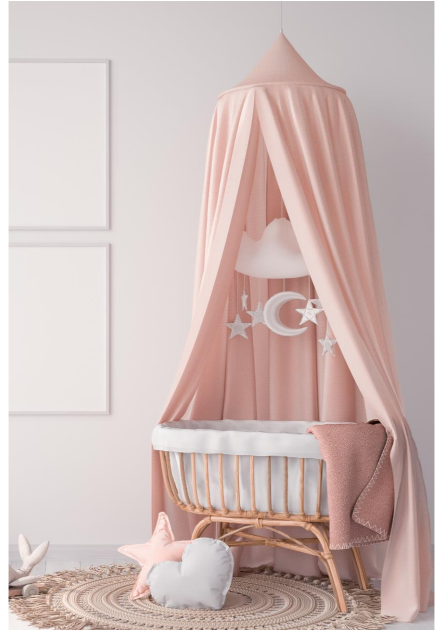
Pantone 12-2007 / UN317500