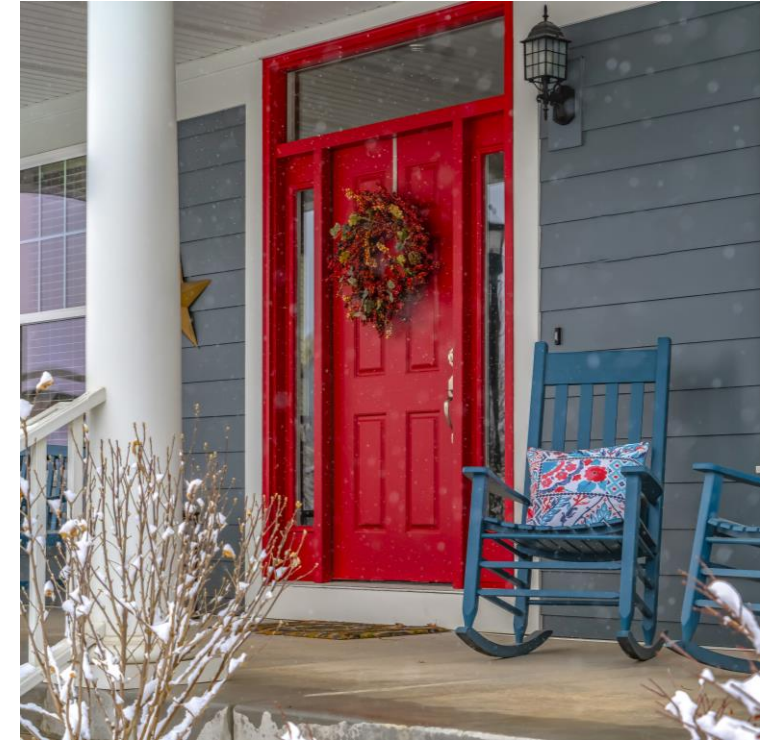
Pantone 17-1561 UN317356