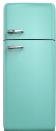
Pantone 13-6030 UN66046