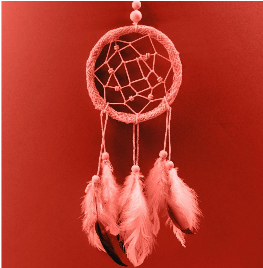
Pantone 16-1663 UN3695