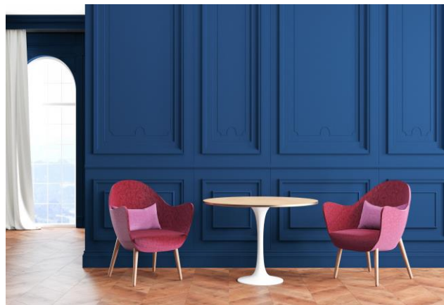
Pantone 19-4135 UN5007