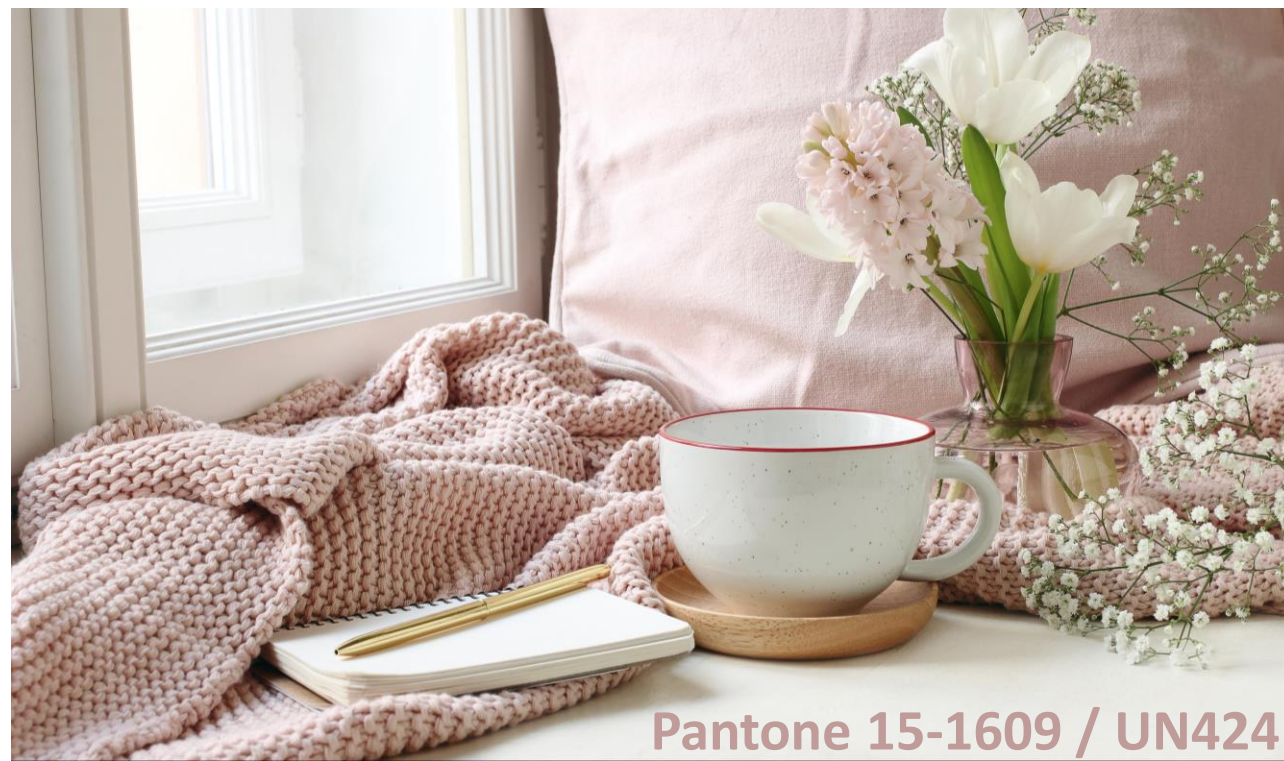
Pantone 15-1609 / UN4241