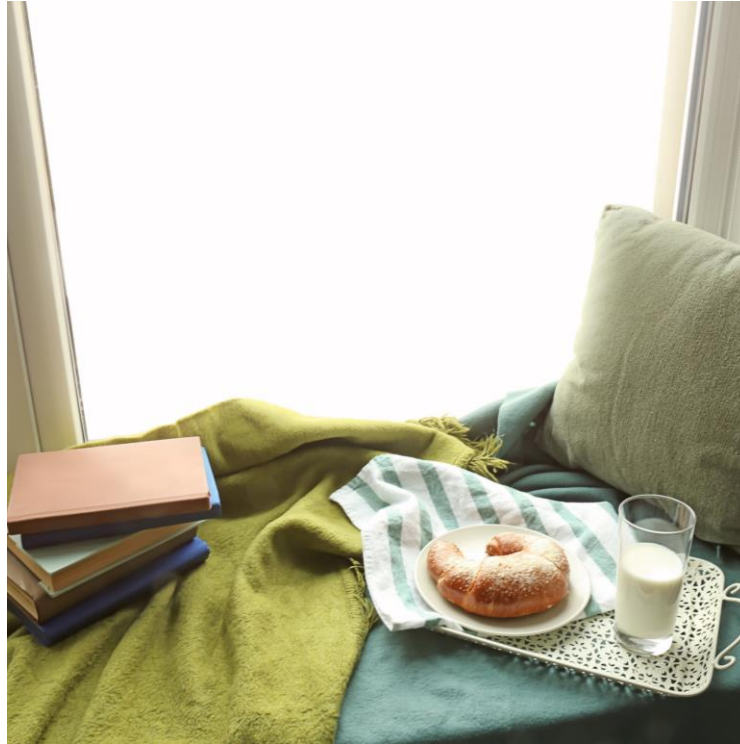
Pantone 17-0542 UN66855