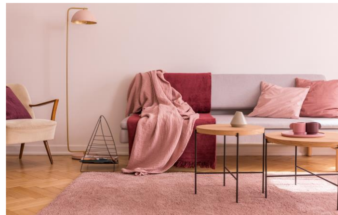
Pantone 18-1548 UN33726