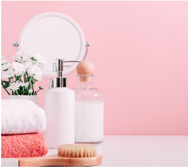
Pantone 14-2116 / UN3487