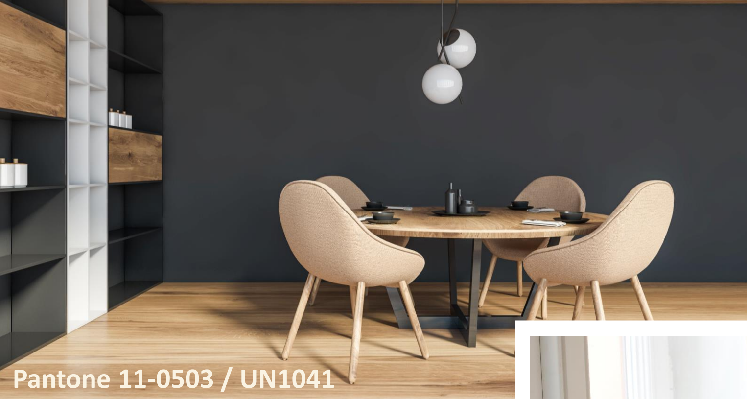
Pantone 11-0503 / UN1041