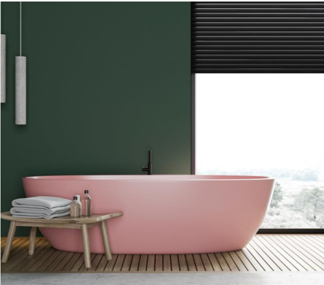
Pantone 13-2820 / UN56698