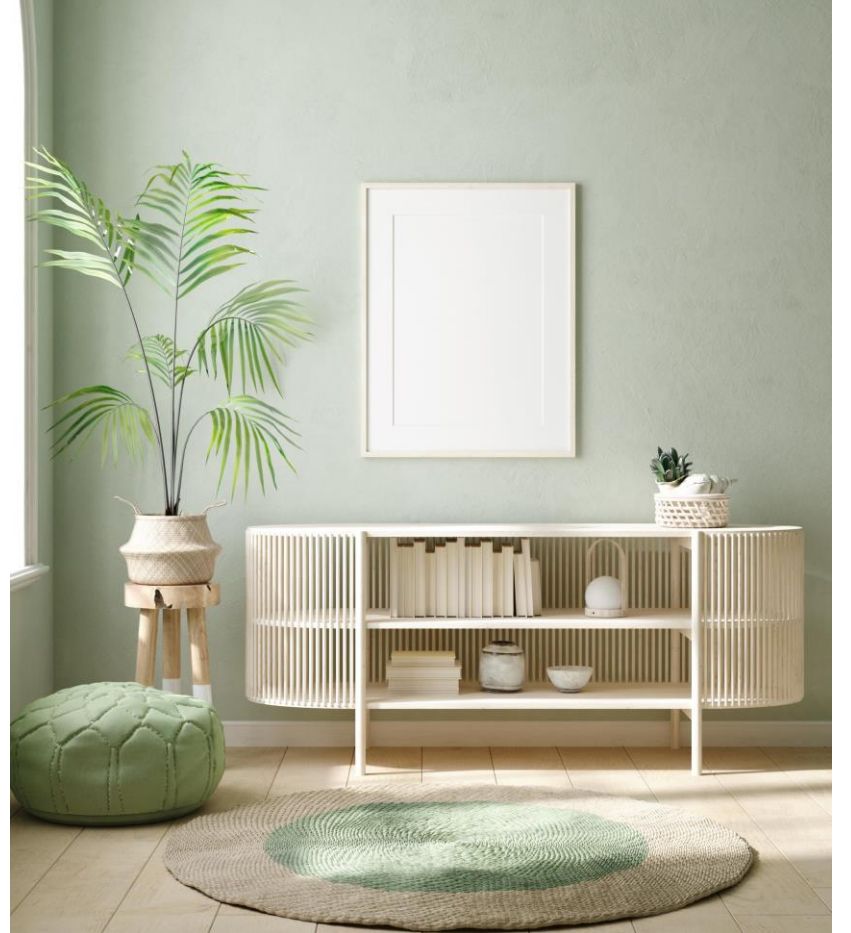
Pantone 13-0240 UN66969