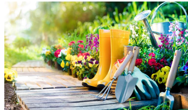
Pantone 14-1140 UN1360