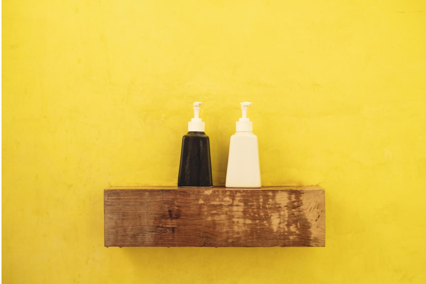
Pantone 12-0660 UN1750