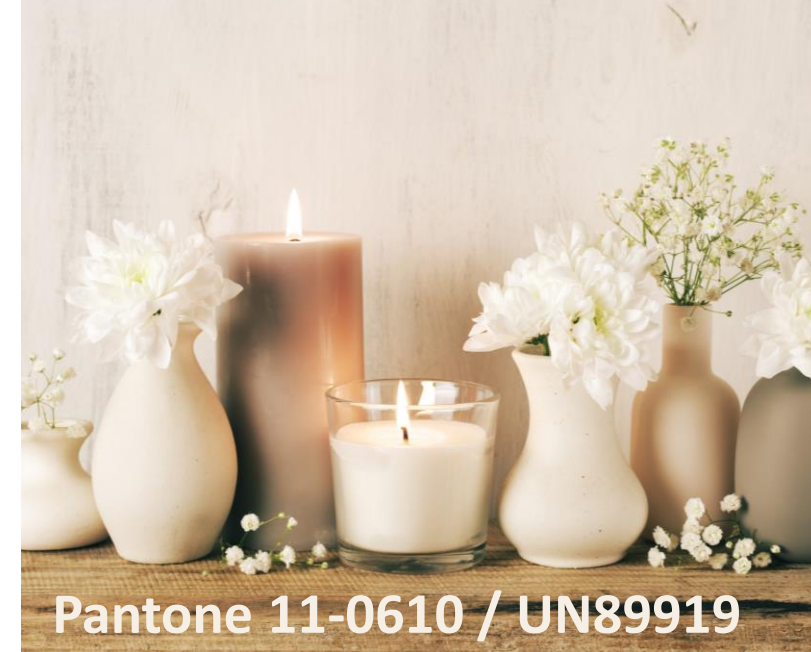
Pantone 11-0610 / UN89919