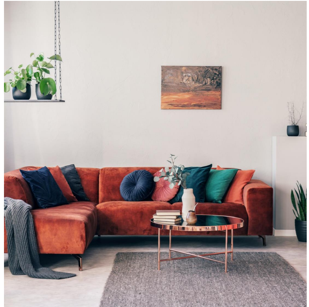
Pantone 16-1534 UN2255