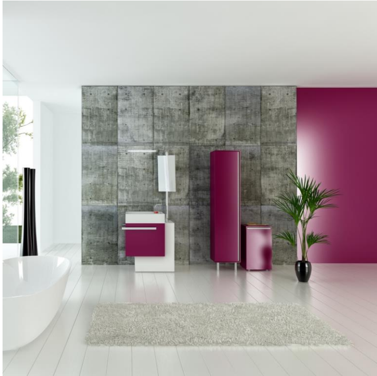
Pantone 18-2350 UN33656