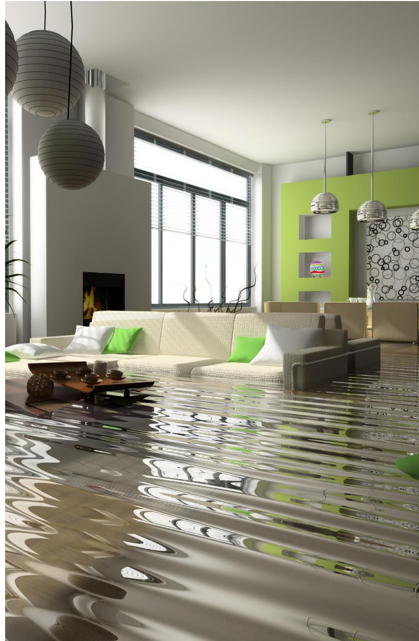
Pantone 15-0262 / UN67047