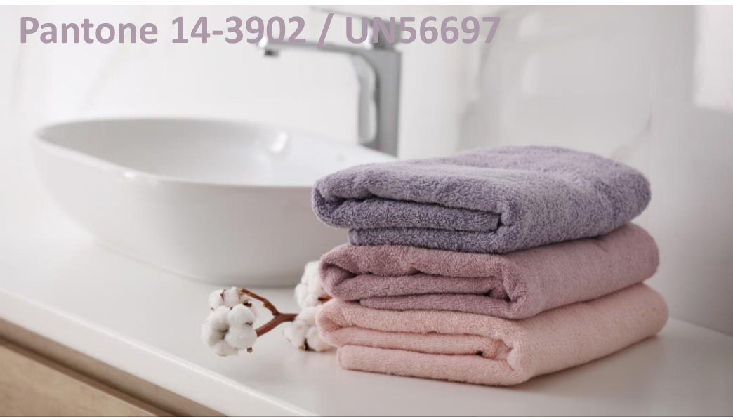
Pantone 14-3902 / UN56697